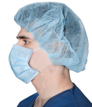
Caps & Shoe Covers