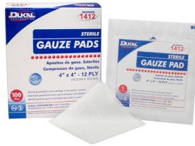
Gauze & Non-Woven Dressings